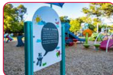
DigiFuse® Arched Sign Panel w/PS Posts

Models shown include standard play products only.