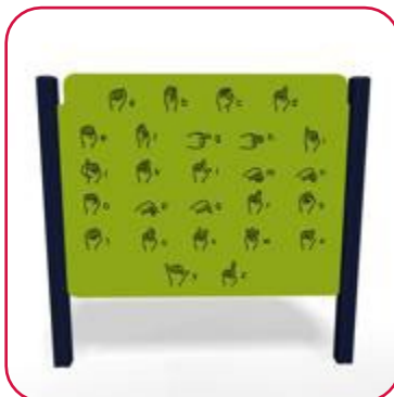
Sign Language Panel