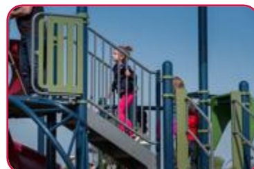
Deck Link w/Steel Barriers