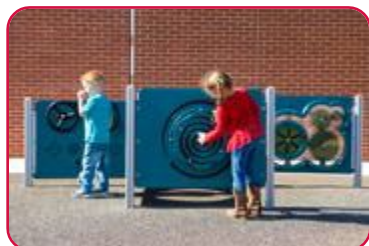
Learning Wall Post DB

Models shown include standard play products only.