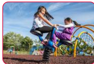
Bobble Rider™, Double

Models shown include standard play products only.