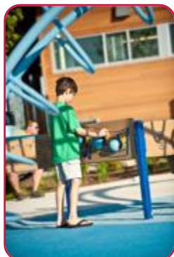
Ring-a-Bell™ Reach Panel