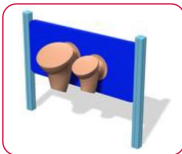
Bongo Reach Panel