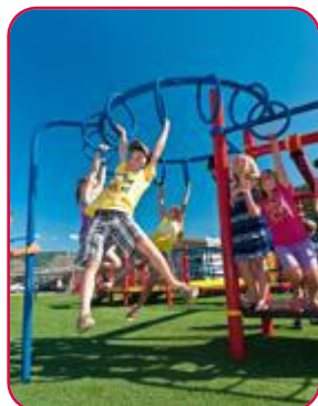
Ring-a-Ling™ Overhead Event