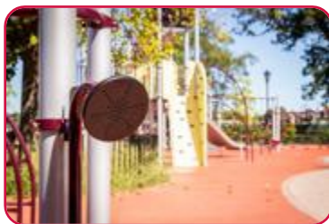
Talk Tube (Direct Bury)