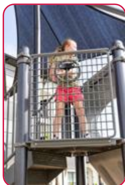
Wire Barrier 90° Tri-Deck