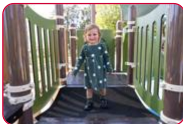
Arch Bridge (42") w/Permalene® Barriers