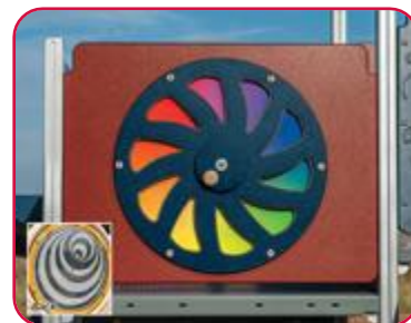
Color Splash Panel™